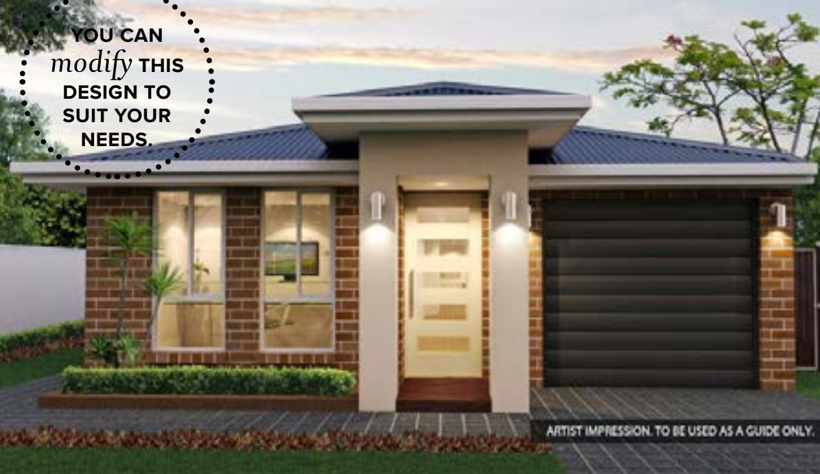
ARTIST IMPRESSION. TO BE USED AS A GUIDE ONLY.

YOU CAN modify THIS DESIGN TO SUIT YOUR NEEDS.